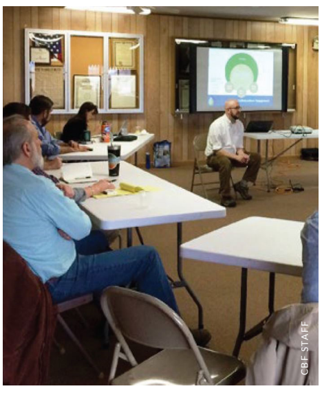
Testing and teamwork at the Halfmoon Creek, left, and Pequea Creek, right, watersheds helped to develop restoration plans that will improve streams in parts of four Pennsylvania counties.