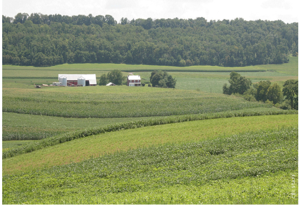
Settlement of a lawsuit requires EPA to focus on using existing tools under the Clean Water Act—ranging from technical assistance and support to compliance and enforcement—to accelerate efforts to keep pollution from running into streams.

Similarly, the EPA is obligated to work with the Department of Environmental Protection (DEP) to consider whether some smaller livestock farms in York and Lancaster Counties should be classified as concentrated animal feeding operations (CAFOs), especially