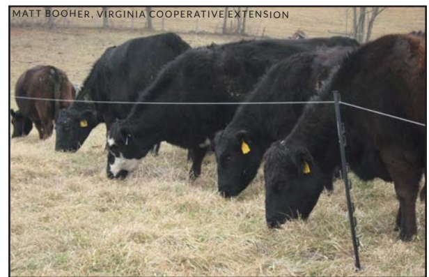
Cattle strip grazing winter stockpile.

While the stockpiled pastures accumulate growth, livestock rotationally graze the other six paddocks. The summer stockpiled