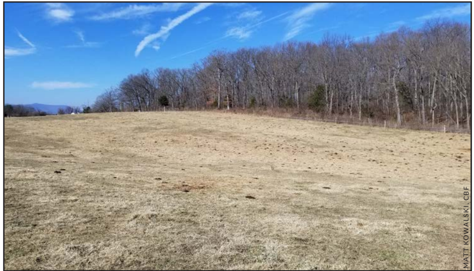
Billy Royston unrolled hay bales in this Warren County, Virginia pasture over the winter. The unused hay and manure piles are now evenly distributed, spreading the available nutrients throughout the pasture.

Some quick estimates prepared by Virginia Cooperative Extension (see Figure 1) show that an average 4 x 5-foot mixed-grass roundbale contains around 12 pounds of nitrogen, five pounds of phosphorus, and 18 pounds of potassium. So, there is about $20 worth of fertilizer in each bale!