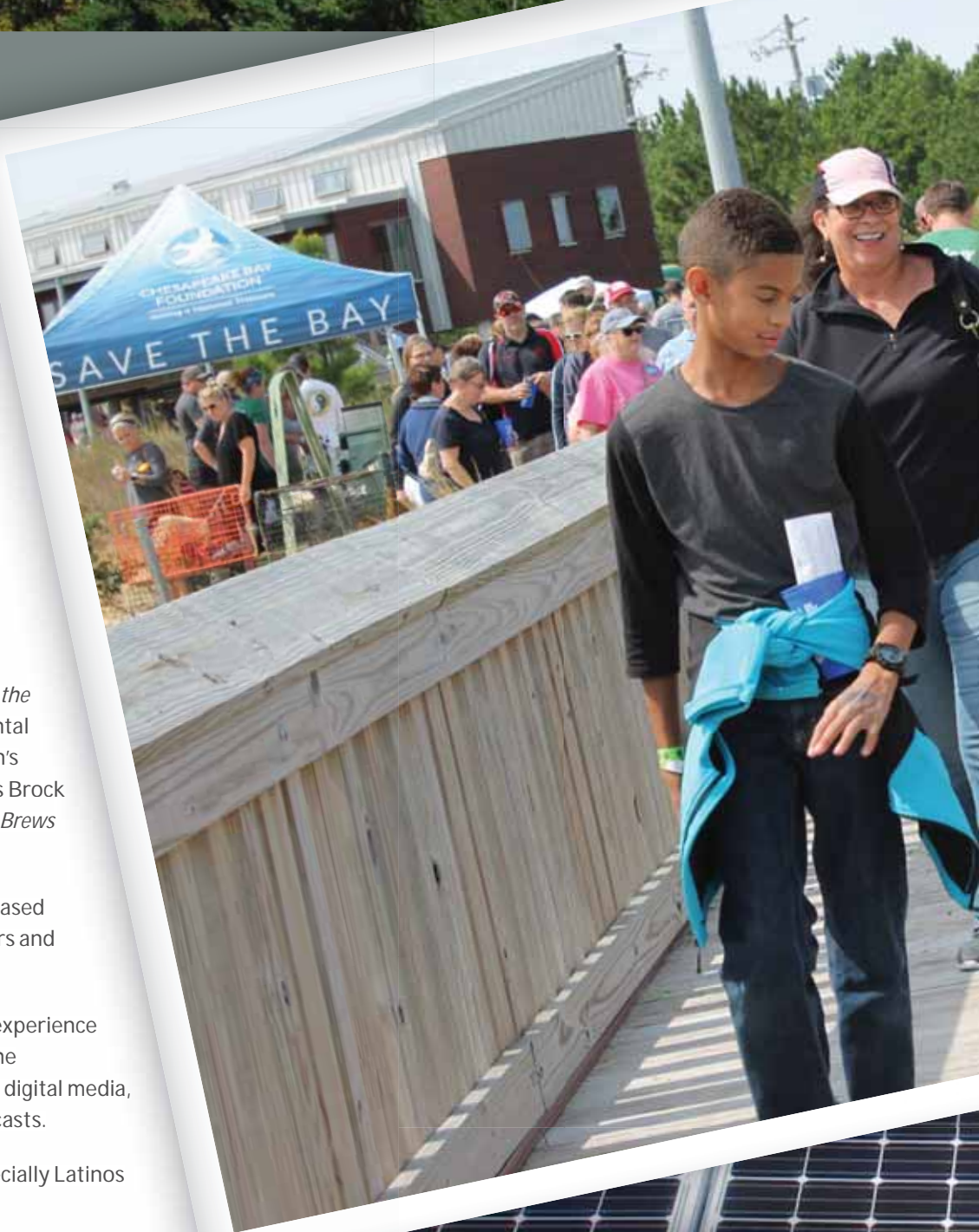
Above: Hundreds of neighbors of the Brock Environmental Center in Virginia Beach came out for Save the Bay Family Day —a celebration of CBF's 50th anniversary.