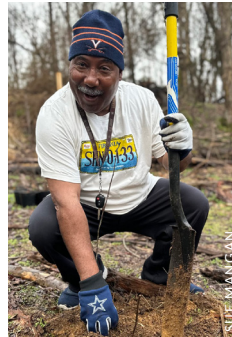
A volunteer helps plant a tree at Mattanock Town.

To learn about the NIN, please visit their website at nansemond.gov .