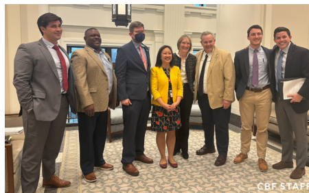
CBF staff and partners celebrate with Delegate Kathy Tran (center, in yellow) after passage of House Bill 985, which bans the sale and use of toxic pavement sealants.

CBF urged the General Assembly to support House Bill 985 (Tran, D-18), which prohibits the sale and use of toxic pavement sealants in Virginia as a cost-effective way to prevent toxic pollution from entering our waterways and harming our children and wildlife. This type of sealant typically contains about 1,000 times more polycyclic aromatic hydrocarbons (PAHs) than sealant products with an asphalt base. PAHs are known to cause cancer, birth defects, and mutations to aquatic life. For the first time since being introduced three years ago, this bill successfully passed both