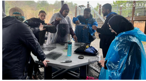
Students from Old Dominion University help build oyster cages as part of their Alternative Spring Break Experience.

CBF staff in Virginia—and our volunteers—are contributing to COA's goal. In March, students