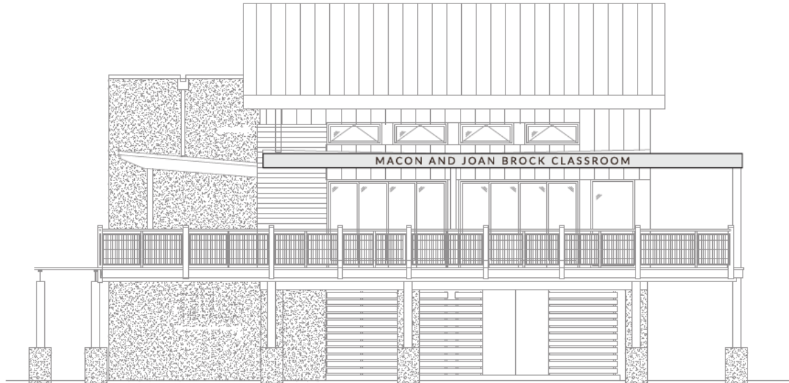
2 SOUTH ELEVATION - DIM. LETTERS 1/8" = 1'