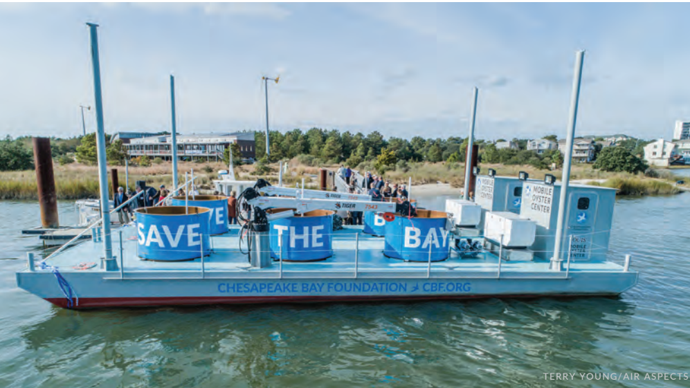
TERRY YOUNG/AIR ASPECTS

We are working hard every day, on land and on the water, to achieve our shared vision of a thriving Chesapeake Bay that enhances our lives, communities, and economy in a way that benefits everyone living in the watershed.