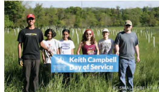
BJ SMALL/CBF STAFF

◀ In Virginia, the brand-new Prudence H. & Louis F. Ryan Mobile Oyster Restoration Center completed its first oyster season. Sitting atop two linked barges in Hampton Roads, we raised over 3.5 MILLION OYSTERS , 780,000 more than expected.