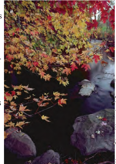
Huron River Watershed Council

in pollutant processing capacity between forested and non-forested segments. Stroud found that forested streams were far more efficient at removing key pollutants in the water than non-forested streams. In the case of nitrogen pollution, forested stream segments removed 200 to 800% more than non-forested segments—a finding that should prove vital to regional water quality improvement programs.