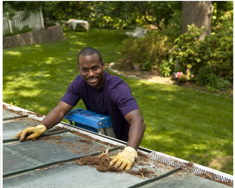
Clean gutters will help keep debris from clogging your dry well